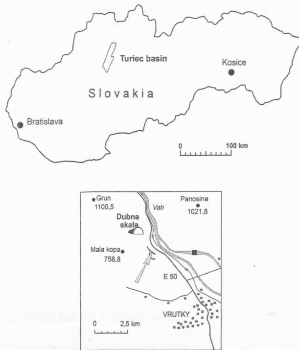
Figure 1: Geographic position of the Turiec Basin in Slovakia and geographic sketch of the Dubná skala cross-section.

The locality consists of two cross-sections. The first is an ancient abandoned quarry with vertical walls and has a particularly difficult access. The cross-section exposes massive bedded and laminated limestone slightly dipping to the basin centre.